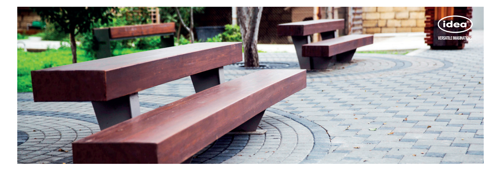
DIMENSIONS: L3000xW700xH350/580 mm