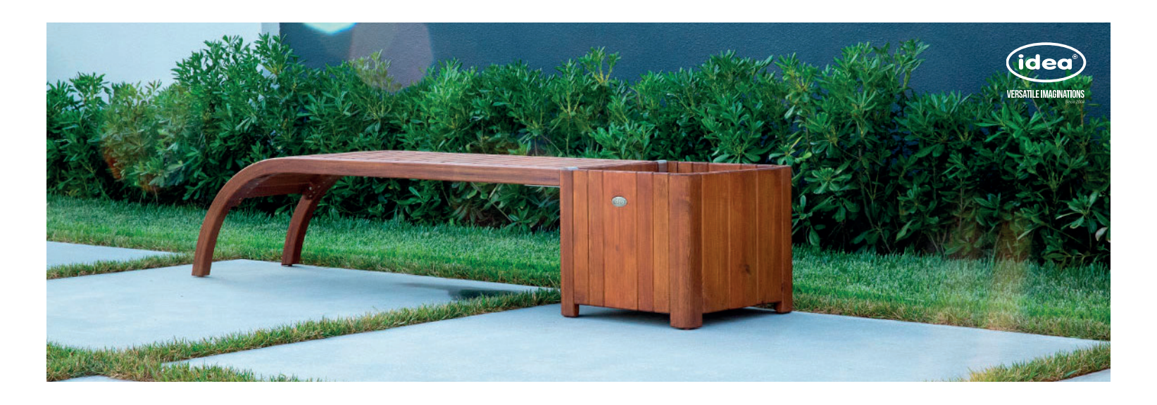
DIMENSIONS: L2300xW450xH440 mm