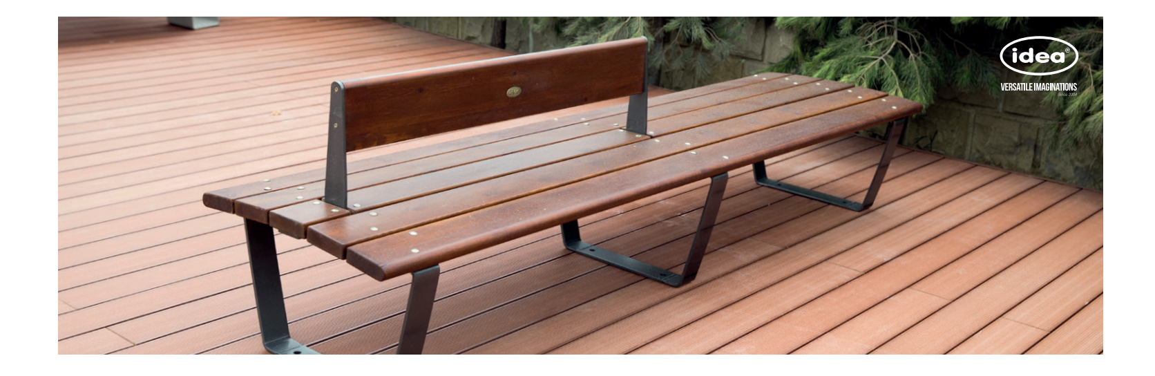
DIMENSIONS: L3000xW710xH440/760 mm